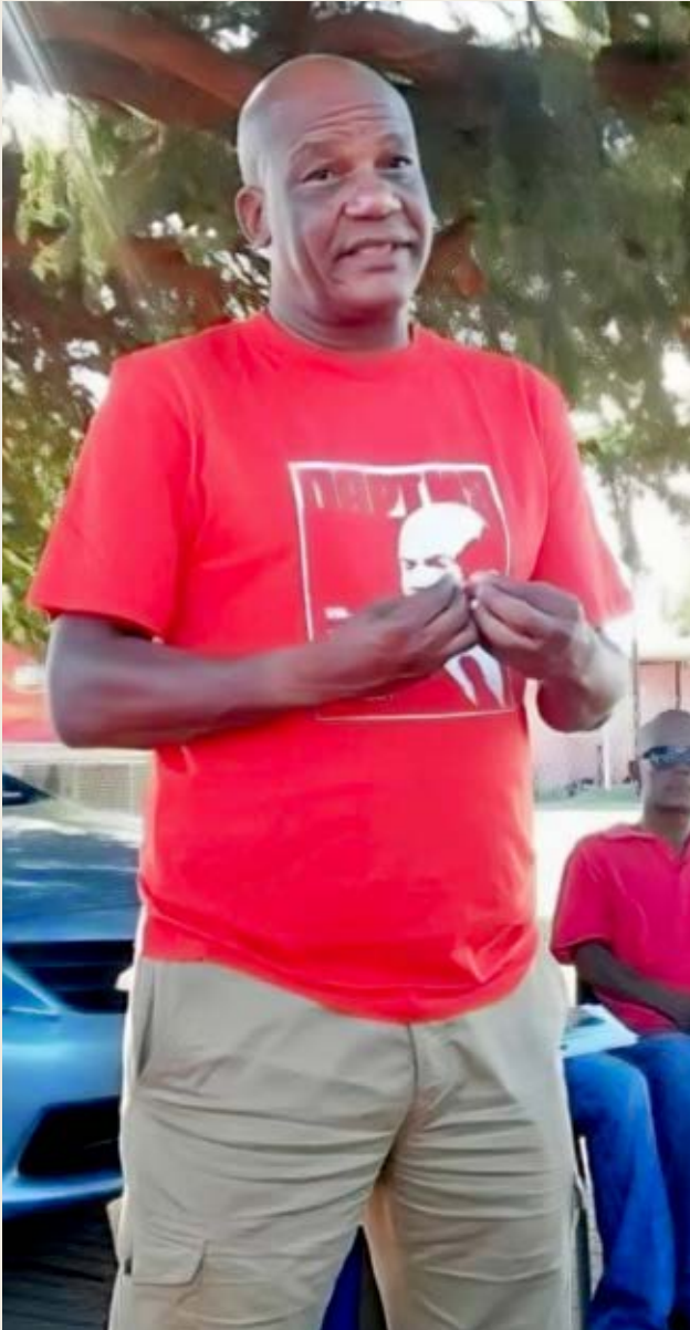
"A humble servant of the people, a courageous communist to the end, a devoted internationalist"

people, a people's hero who gallantly confronted the apartheid regime and its surrogates in the struggle for freedom, a communist to the end and a devoted internationalist par excellence, a people's hero and man of the grassroots masses. He was a disciplined cadre who avoided conflict when necessary and yet was never ambivalent on adherence to Party discipline. He never held grudges but was clear and very firm against truancy and deceitfulness.