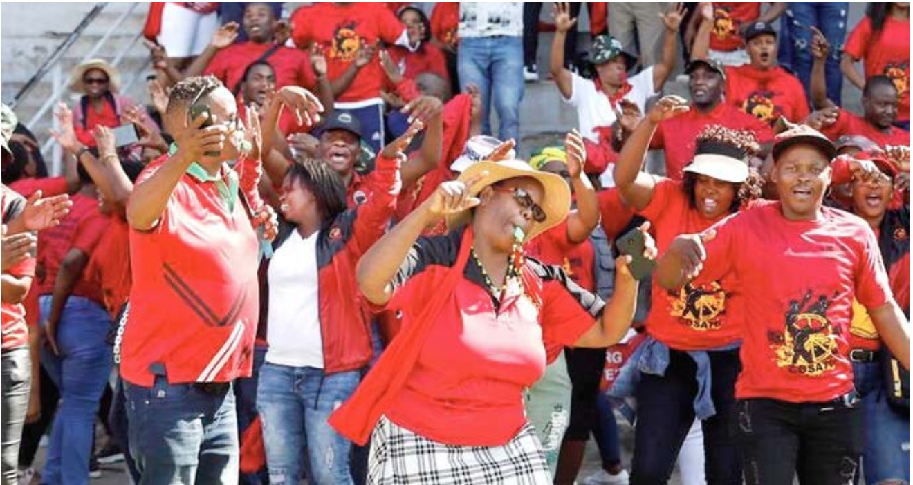
May Day shouldn't just be about celebrating labour rights but building a socialist movement of workers and the poor