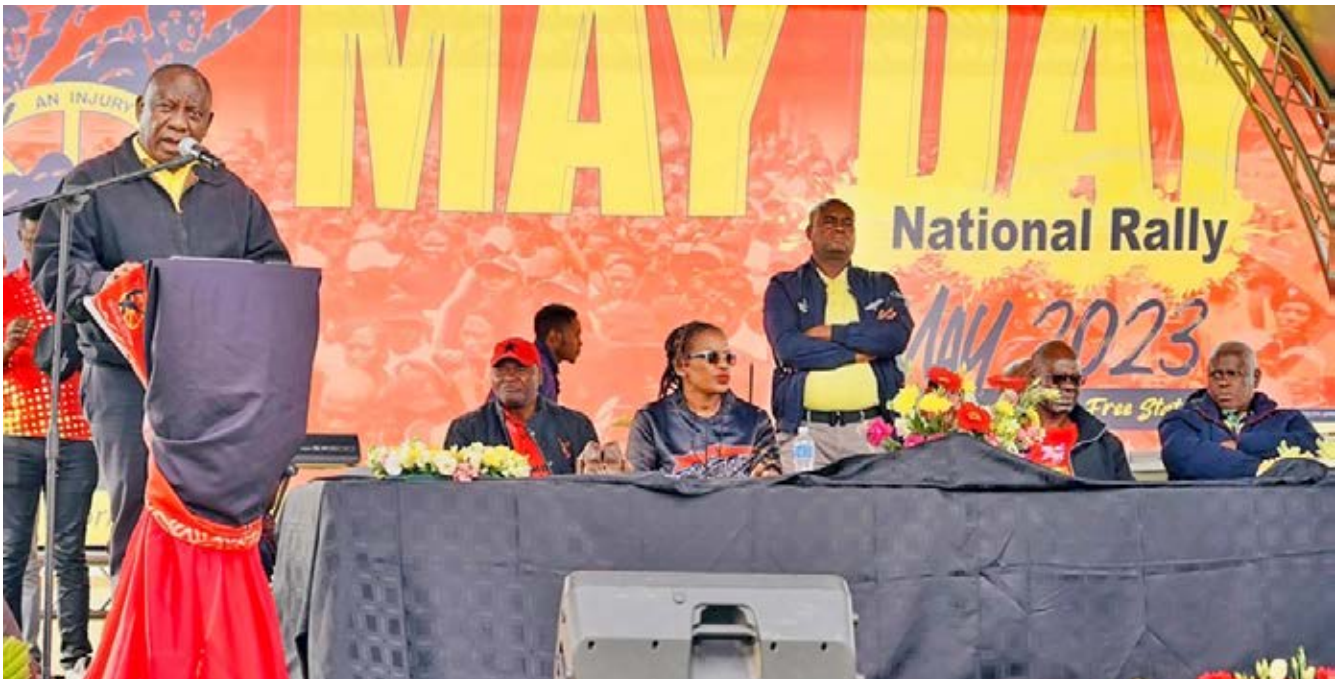
President Cyril Ramaphosa speaking at the national May Day rally in Bethlehem, Free State