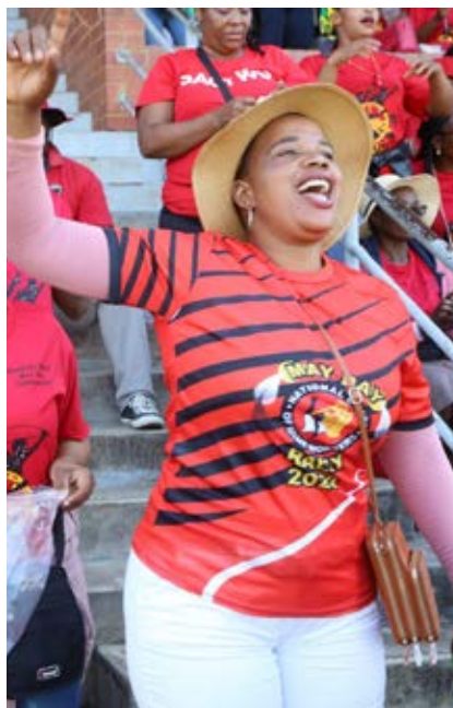
Rallying for victory

their struggles be advanced on all fronts and have been clear that working class struggles must be waged on the political front, in the Alliance, at Nedlac, in Parliament and in the streets.