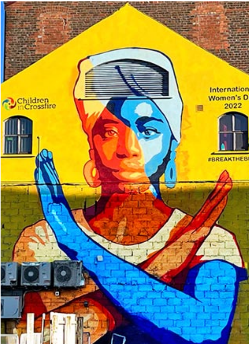
Break the bias: International Women's Day 2022 mural in Belfast, Ireland, by anti-war NPO Children in Crossfire

GBV and femicide. We need to eradicate sexual harassment from society.