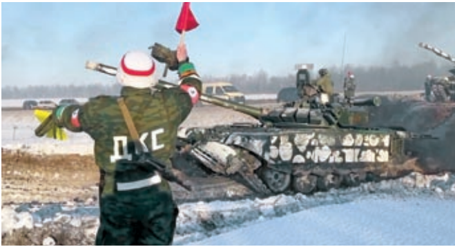
Russian tanks crossing into Ukraine from Belarus in February ...