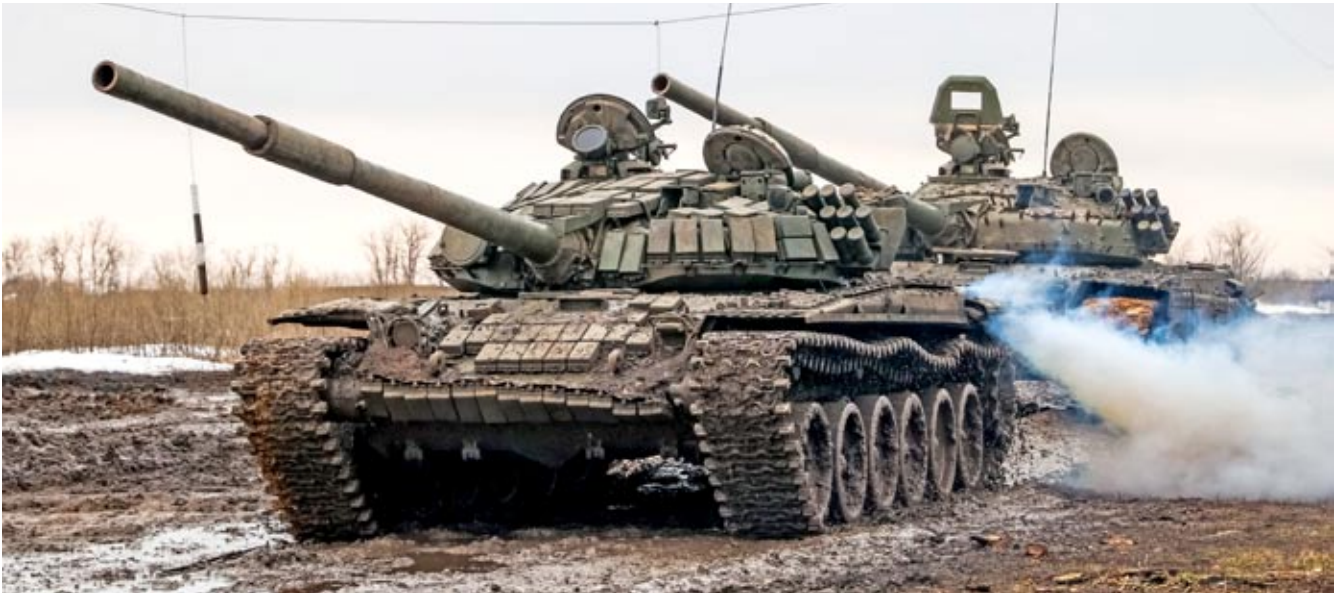
Russian T-72B3 tanks rumble through Donetsk early in the Ukrainian conflict