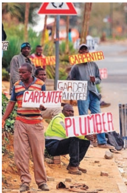
Jobless workers picketing for piece-work in Johannesburg

Besides addressing unemployment towards securing the right of all to work, structural economic transformation must radically reduce inequality, eradicate poverty and resolve the associated crisis of social reproduction.