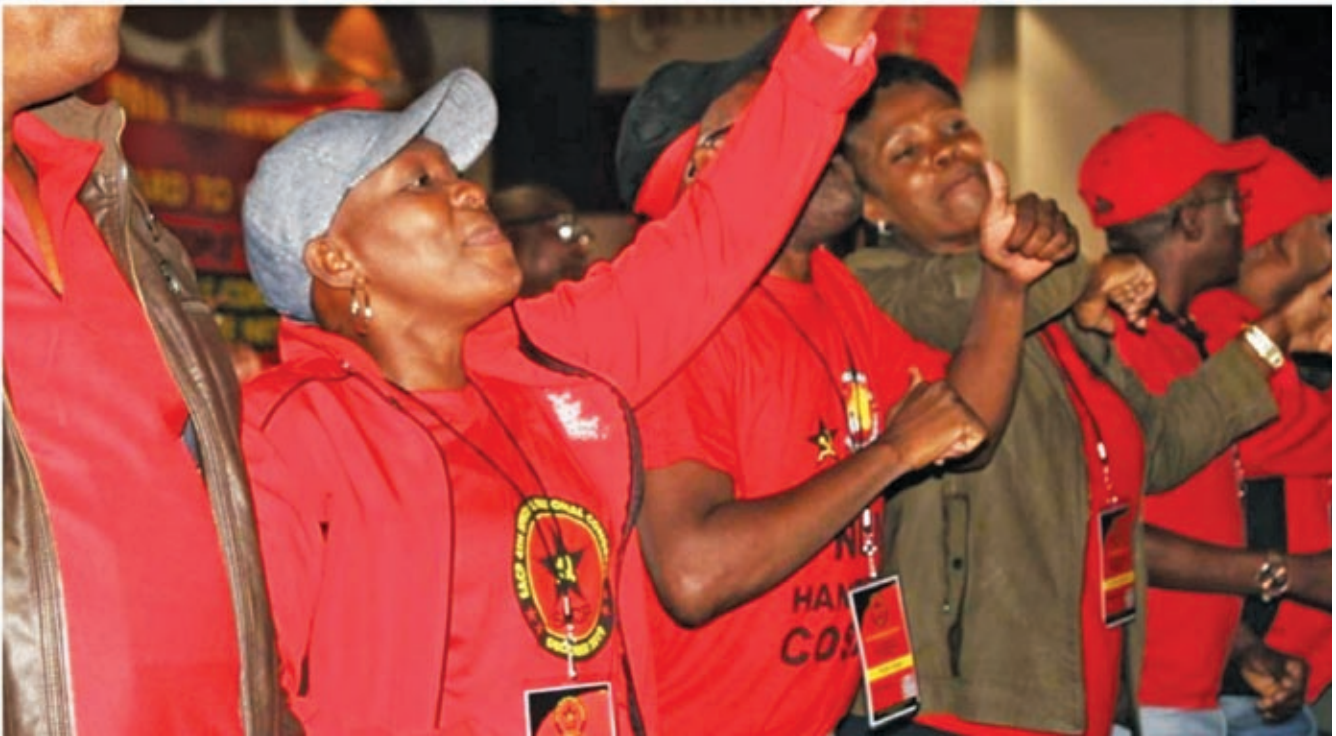
Delegates mark the opening of the SACP's 2019 4th special National Congress