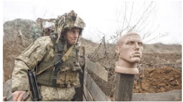
...while a soldier waits in Ukrainian entrenchments