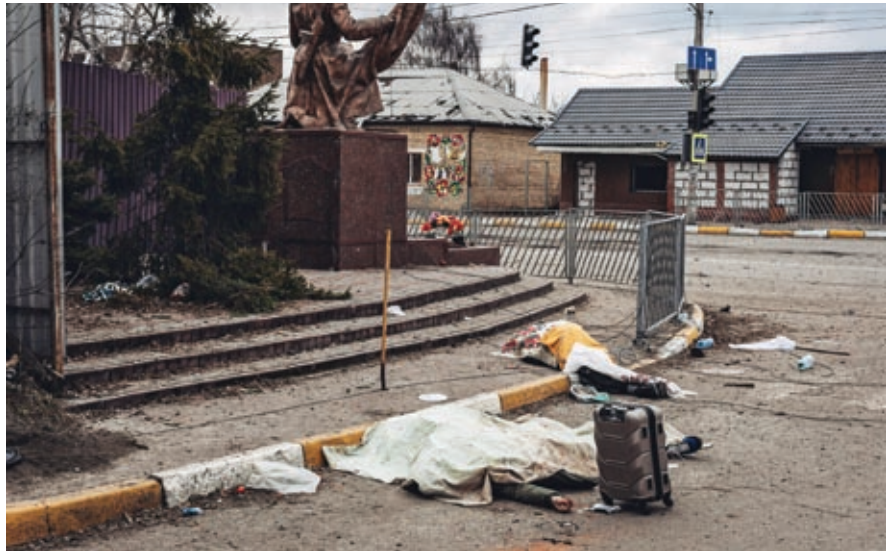
CIVILIAN DEAD: The bodies of refugees killed in fighting in Irpin, north of Kyiv, lie below a memorial to the dead of the USSR's victorious struggle to defeat Nazi Germany.

Through its expansion, Nato seeks not only to extend its sphere of military presence and domination but in the end to entrench the monopoly of the world economy through its transnational corporations to control natural resources, other sectors and markets in other countries and global regions. How can we as Africans ever forget the motive underpinning Nato's 2011 bombing of Libya, causing massive destruction and loss of life? Joe Biden, the current president of